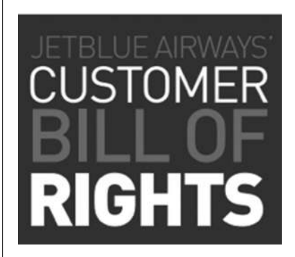
Fig. 3 for Question 3

JetBlue is dedicated to making every part of your experience as simple and pleasant as possible. Unfortunately, there are times when things do not go as planned. If you are inconvenienced as a result, we think it is important that you know exactly what you can expect from us. That's why we created our Customer Bill of Rights. These Rights will always be subject to the highest level of safety and security for our customers and crew members.